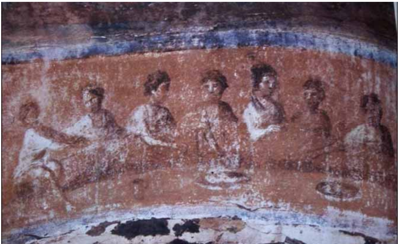
CELEBRATING THE LORD’S SUPPER IN THE EARLY SECOND CENTURY

The early church writings always describe the final (perfected) oblation as being the sacrifice of Jesus Christ. We can learn about the Holy Communion oblation of the church through the early church fathers. Perhaps the earliest description of the celebration of the Eucharist outside the New Testament is from the Didache (chapter 14), which many believe is from the second half of the first century. The Didache was written at the time of the Apostles.