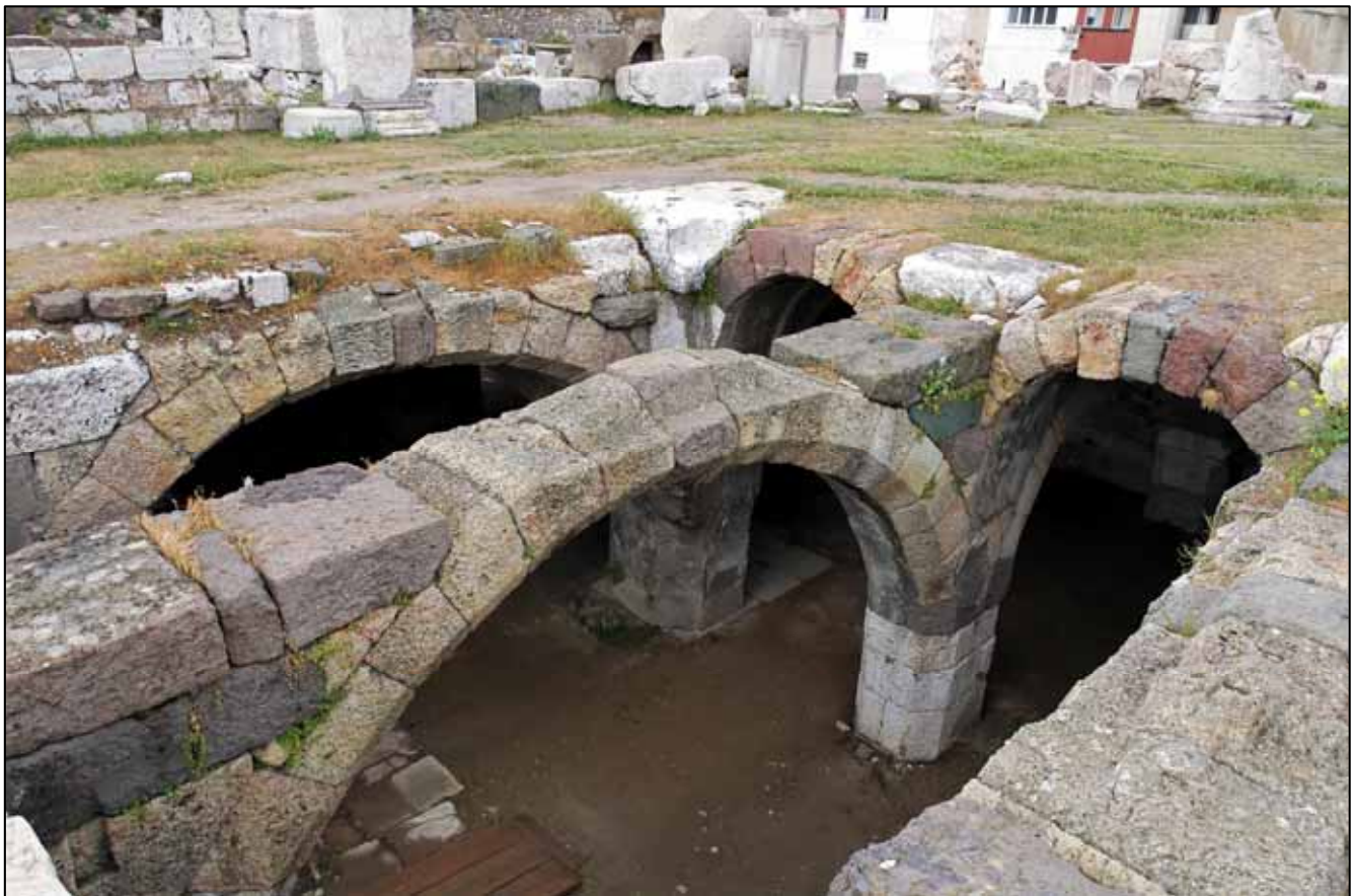
ANCIENT SMYRNA RUINS TODAY

Smyrna was taken over by Islam—the false teaching of the Four Horsemen. The Islamic Seljuk commander Tzachas seized Smyrna in 1084 AD. The city was several times ravaged by the Turks. In 1402 AD, Tamerlane stormed the town and massacred almost all the inhabitants. The Mongol conquest was only temporary, but Smyrna was recovered by the Islamic Turks after which it became Ottoman, when the Ottomans took over the lands of Aydın after 1425 AD. Some Greek influence persisted and for a time it was the “Smyrna of the infidels.” Today it is 99% Islamic.