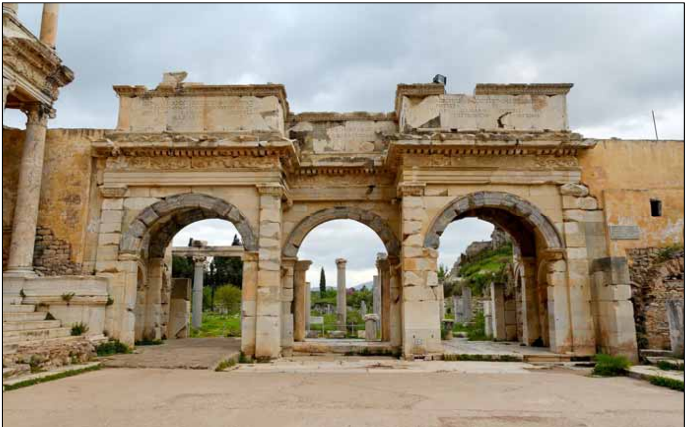
ANCIENT EPHESUS CITY GATES

Contrary to the terms of the surrender, the Islamic Turks pillaged the church of Saint John and deported most of the local population. During these events many of the remaining inhabitants were massacred and the city ceased to exist from then onward. Ephesus was completely abandoned by the 15th century. Islam killed the city and the church.