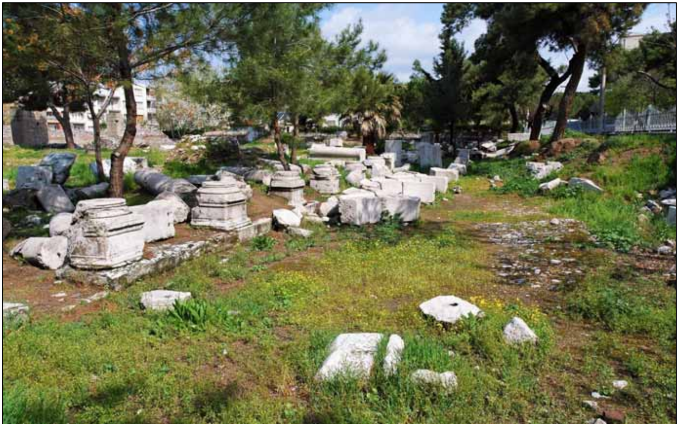
ANCIENT THYATIRA RUINS TODAY

In the 14th century, Islamic Turks regained all Western Anatolian lands and Thyatira went under Islamic Turkish rule in 1307. In August 1922, because of the capture of the city by the Islamic Turkish nationalist army, the last remaining local Christian "Greeks" were killed. Since then, there has been no Christian community in Thyatira. The city is 100% Islamic today.