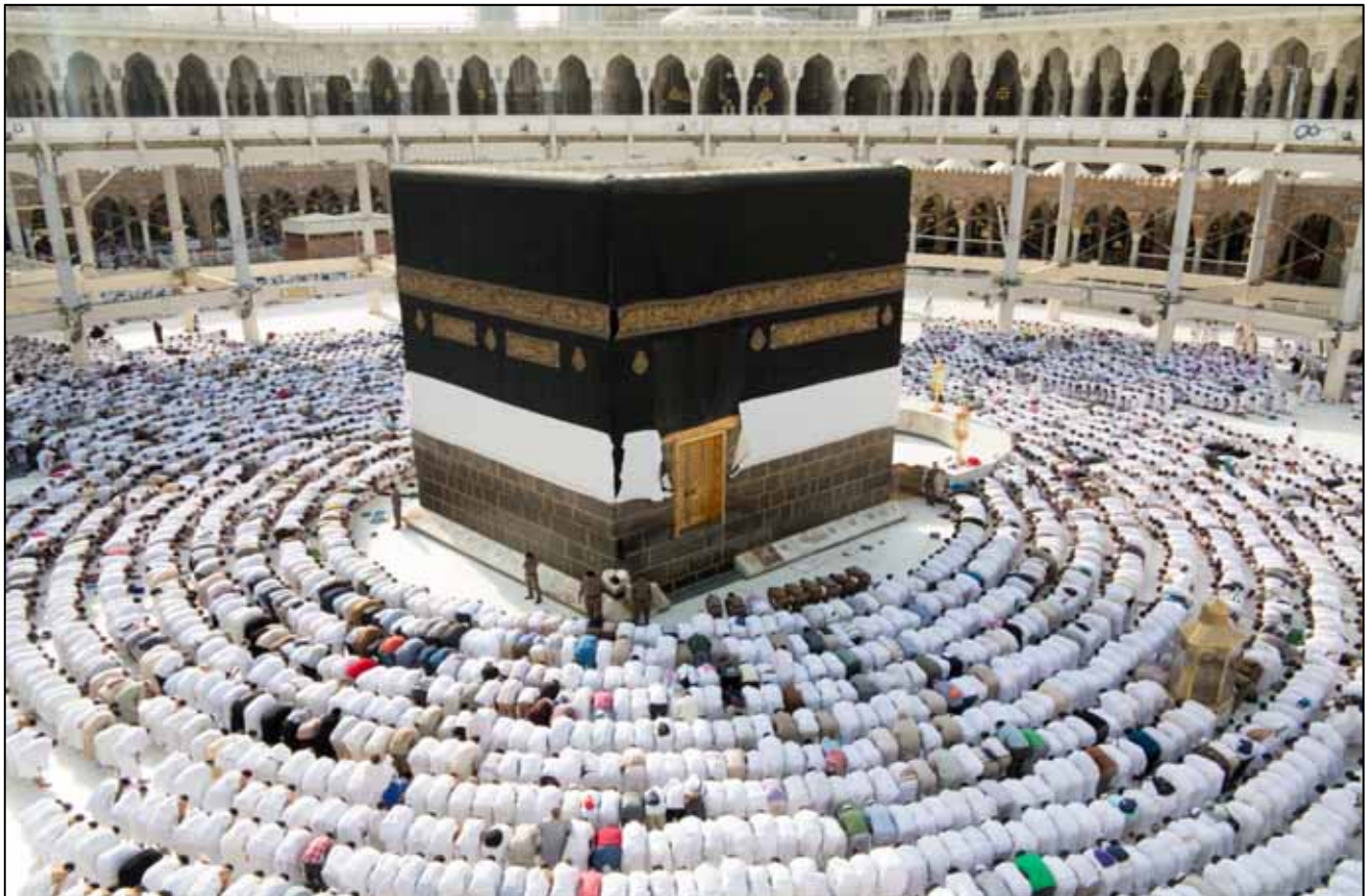
WORSHIPPING BAAL THE BEAST AND THE BLACKSTONE IN THE KAABA

“Likewise, you also have those who hold to the teaching of the Nicolaitans.” The Nicolaitans were previously discussed on the church at Ephesus. Both Pergamon and Ephesus were connected to the false god Artemis (Cybele), and both worshiped a black stone that “fell from heaven.” They are connected to the worship of Baal. The Blackstone today is in the Kaaba in the great city of Mecca.