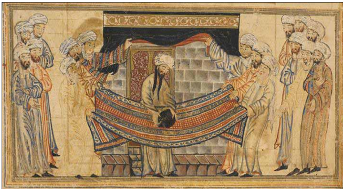
THE FALSE PROPHET MOHAMMAD PLACES THE BLACKSTONE IN THE KAABA

The Blackstone is a meteorite set into the eastern corner of the Kaaba, the House located in the center of the Grand Mosque in Mecca, Saudi Arabia. Mohammad came to Mecca after a fire damaged the Kaaba. The citizens couldn't agree on where to place the Blackstone and decided to ask the next person to walk through the city gates to make the decision. That person turned out to be Mohammad who set the Blackstone into the center of the Kaaba, where it is worshipped by tens of millions of Muslims to this day. It is the "image of the beast" that Jesus warns us about.