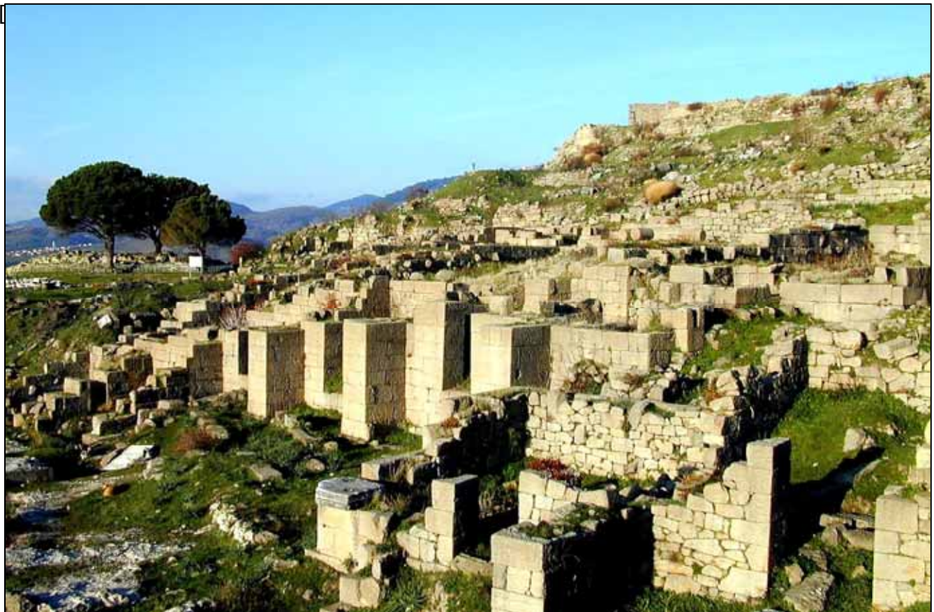
ANCIENT PERGAMON ACROPOLIS

Pergamon was sacked again by the armies of the Islamic al-Malik. It was again rebuilt and refortified after the Arabs abandoned their Siege of Constantinople in 717–718 AD. It suffered from the attacks of the Islamic Seljuks on western Anatolia after the Battle of Manzikert in 1071 AD, and after attacks in 1109 and in 1113, the city was largely destroyed. With the expansion of the Anatolian Islamic armies, Pergamon was absorbed into the Islamic orbit shortly after 1300 AD, and then conquered by the Islamic Ottomans. It has been in Islamic hands ever since.