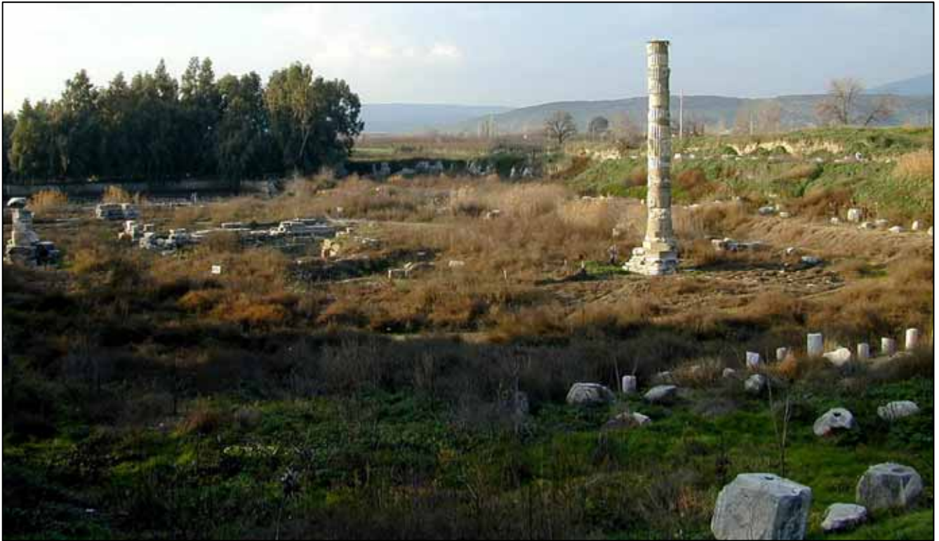
EPHESUS TEMPLE OF ARTEMIS ANCIENT RUINS