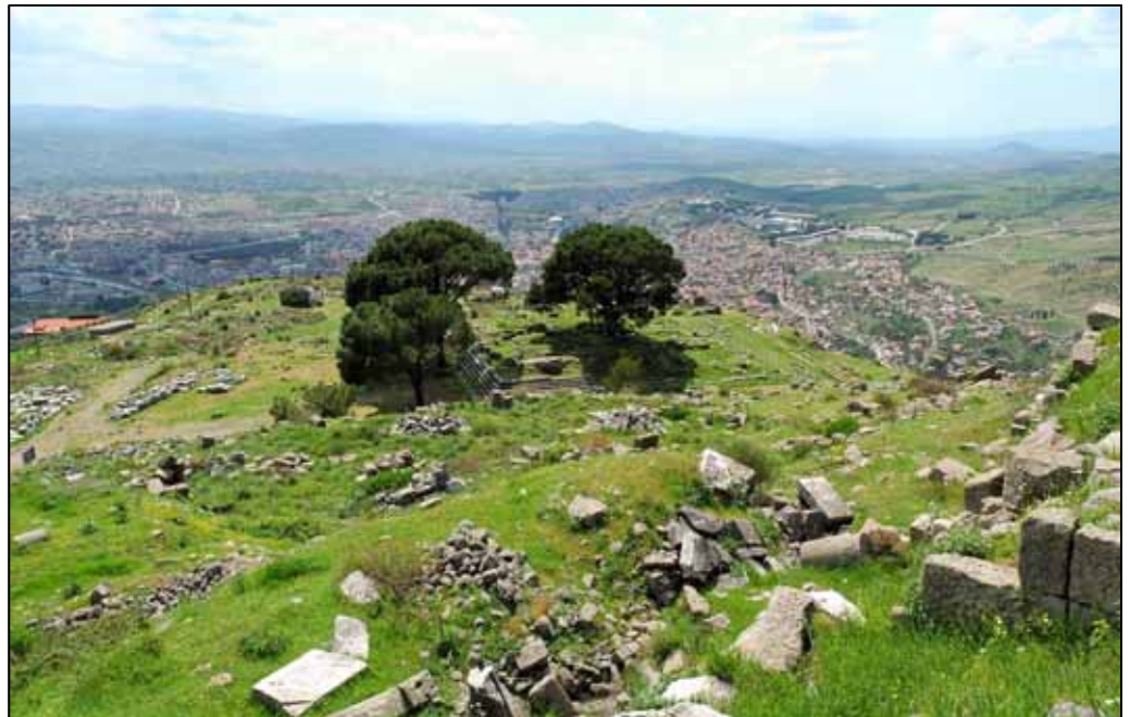
THE GREAT ALTAR OF ZEUS AT PERGAMON

Jesus tells the church in Thyatira He know their deeds, they have love and faith, service and perseverance, and they are now doing more than at first. But Jesus tells them not to tolerate the woman Jezebel, who calls herself a prophet. With her teaching she misleads His servants into sexual immorality and the eating of food sacrificed to idols.