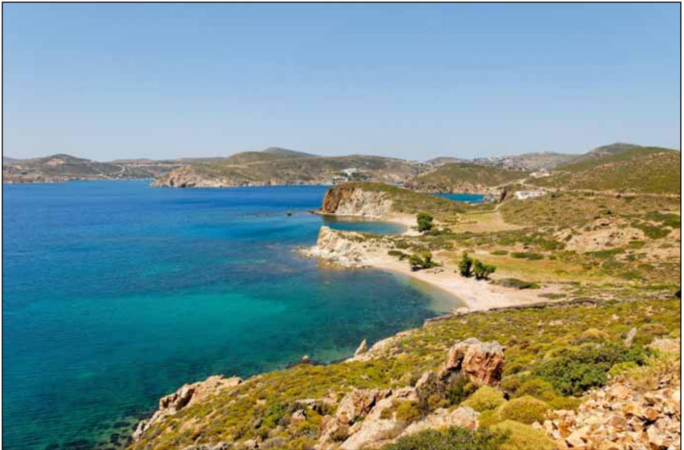
THE BEACHES ON THE NORTHERN PART OF PATMOS

Revelation 1:19 “Write, therefore, what you have seen, what is now and what will take place later. Revelation 1:20 The mystery of the seven stars that you saw in my right hand and of the seven golden lampstands is this: The seven stars are the angels of the seven churches, and the seven lampstands are the seven churches.”