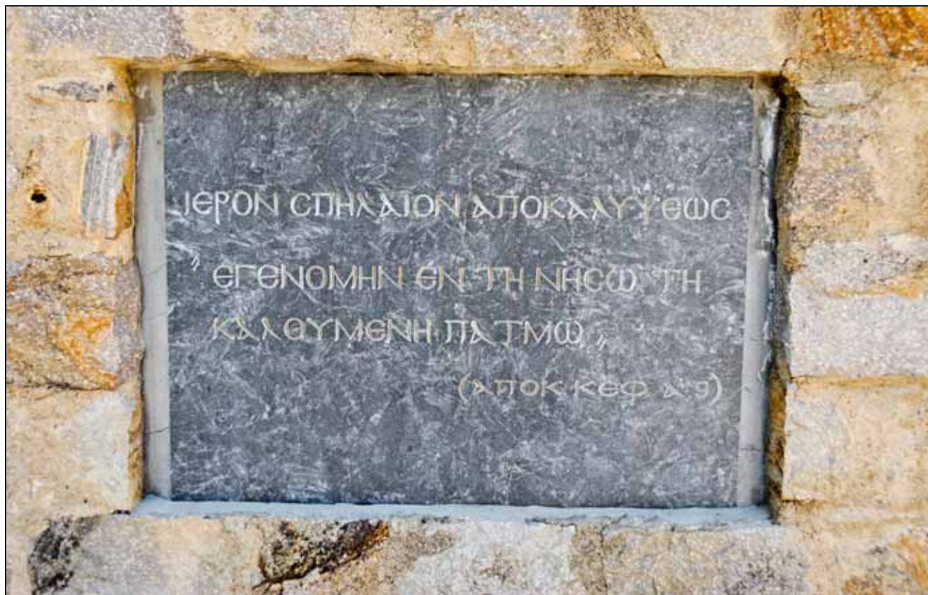
INSCRIPTION FROM CAVE THOUGHT TO BE WHERE JOHN LIVED ON PATMOS

Soon the Four Horsemen of Revelation chapter six (Mohammad, Abu Bakr, Umar and Uthman) would sweep across the Christian lands 624-660 AD. Their Umayyad Caliphate would exercise authority over one quarter of the world (Revelation 6:8), just as Jesus said they would.