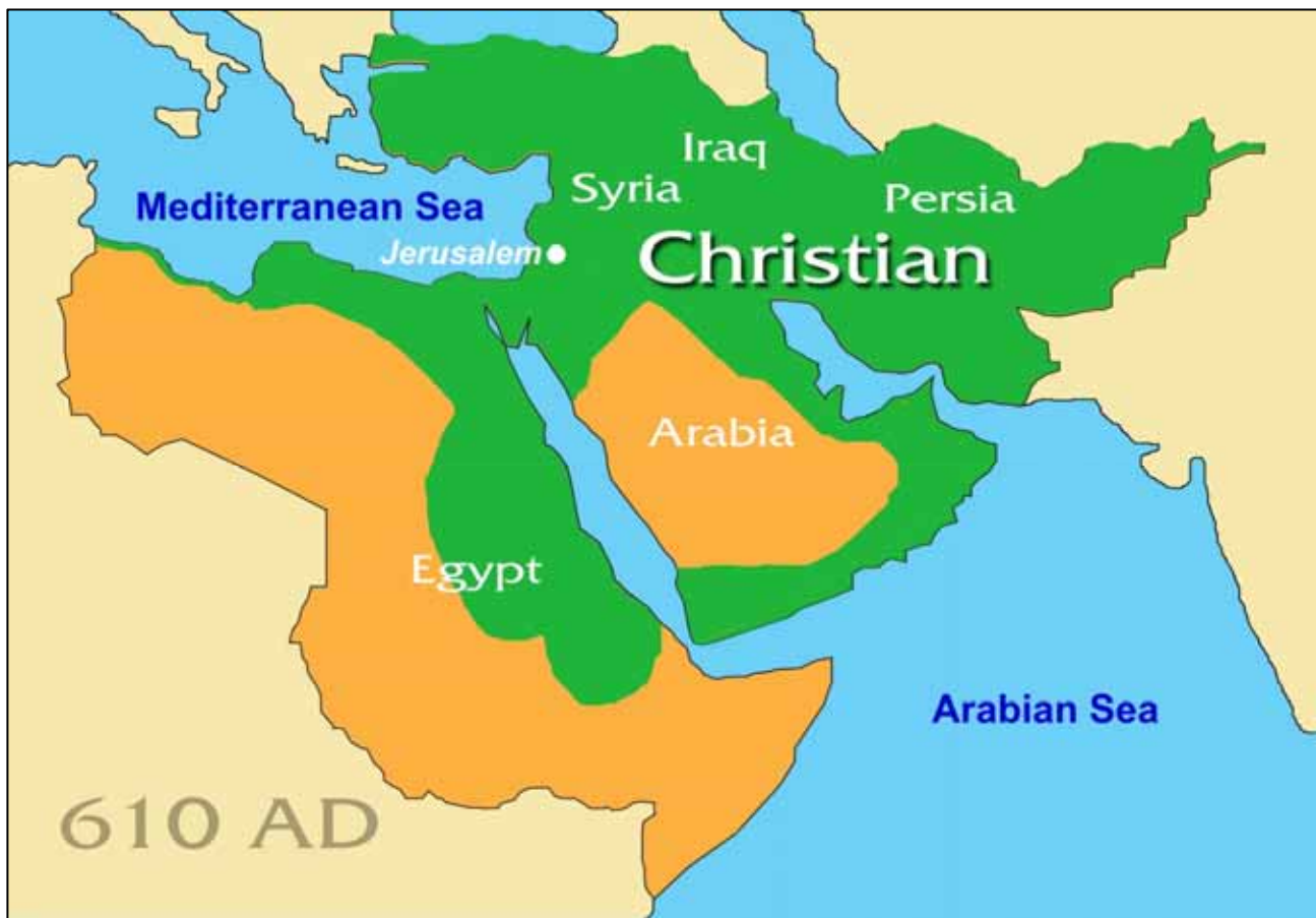
MOST OF THE MIDDLE EAST WAS CHRISTIAN IN 610 AD

Five months is 152 days, or most likely 152 years. During the time period of 610 AD to 762 AD, the Islamic locusts went from one man with a vision from a demonic spirit (Mohammad seeing Baal) to sweeping over nearly every country in the Middle East that was previously Christian.