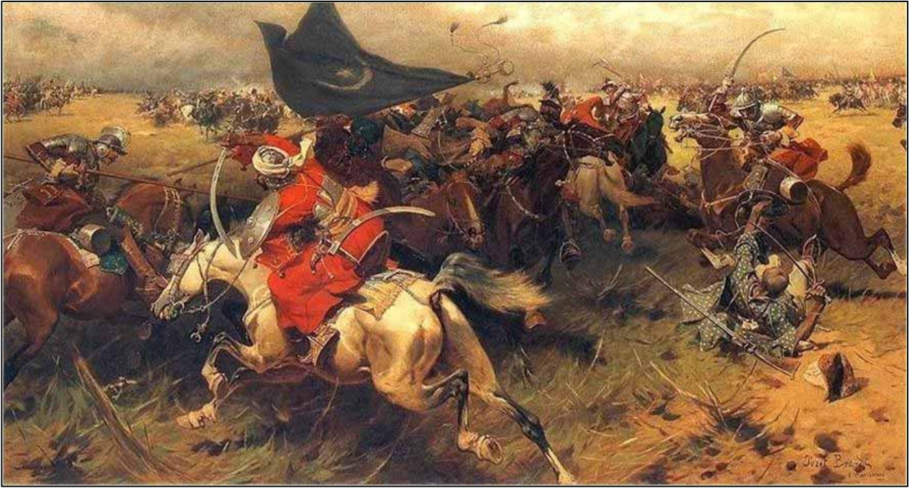
THE ISLAMIC LOCUSTS SWEEP ACROSS THE MIDDLE EAST WITH THE SWORD