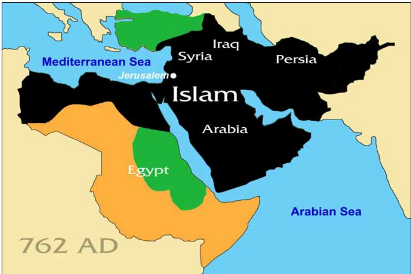
MOST OF THE MIDDLE EAST WAS ISLAMIC BY 762 AD