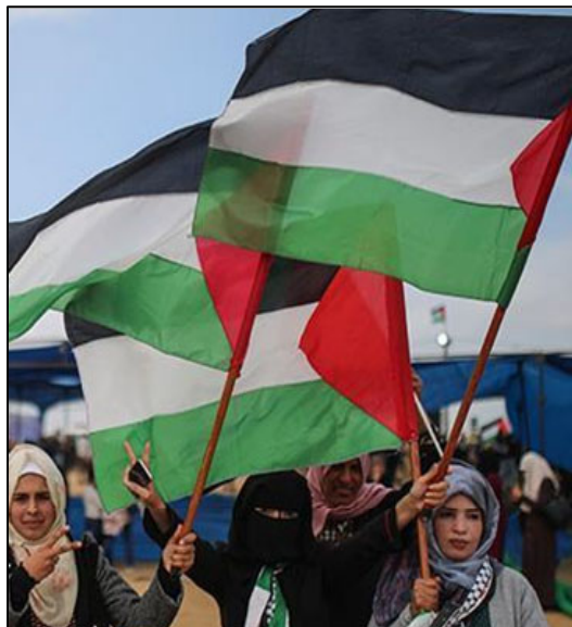
THE FOUR COLORS OF ISLAM

Most prophecy teachers misquote Revelation 6:8 by writing "one quarter of the world will be killed." Since this apparently has not happened, they look to the future and miss the prophetic meaning. The Bible does not say one quarter of the world will be killed. The Bible says "Authority was given to them over a fourth of the earth." Never change the text of Revelation because a severe punishment from God is given as a warning by God at the end of the Book of Revelation!