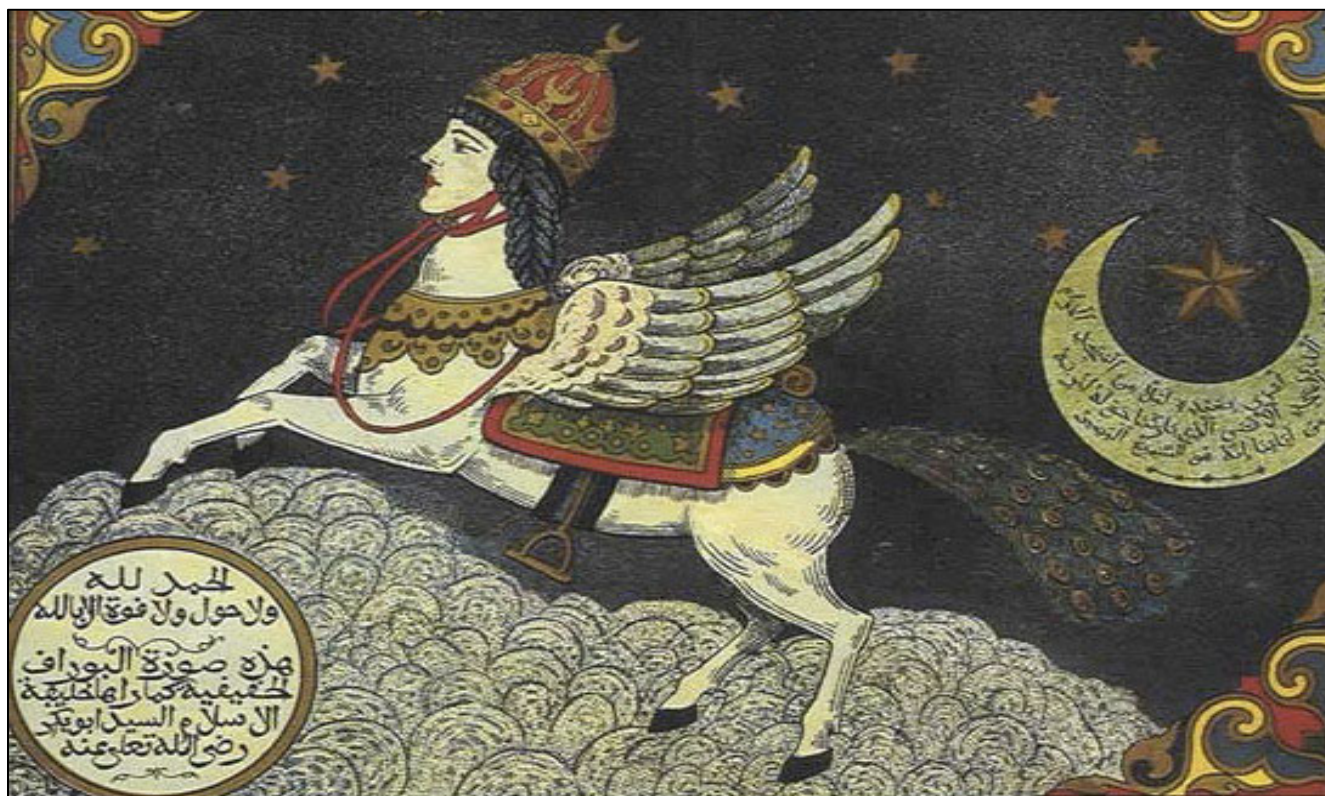
MOHAMMAD'S NIGHT JOURNEY--ON A WHITE HORSE WEARING A CROWN

The Dome of the Rock blasphemes Jesus, is in the Outer Court, and is the exact location excluded by God (Revelation 11:2 " Leave out the court which is outside the temple and do not measure it, for it has been given to the nations; and they will tread under foot the holy city for forty-two months. ")